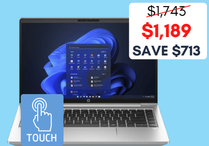
HP ProBook 445 G11 14" AMD Ryzen 5 + 3yr Onsite Support 16GB RAM / 256GB Storage Touchscreen