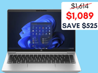
HP ProBook 445 G11 14" AMD Ryzen 5 + 3yr Onsite Support 8GB RAM / 256GB Storage