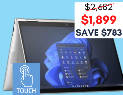
HP EliteBook 830 x360 G11 13.3" Intel i5 + 3yr Onsite Support 16GB RAM / 256GB Storage Touchscreen + Pen