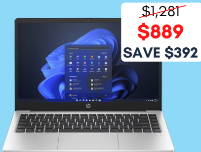
HP 245 G10 14" AMD Ryzen 3 + 3yr Onsite Support 8GB RAM / 256GB Storage

Purchased separately after 4 day mandatory cooling off period, please see back of flyer for more details.