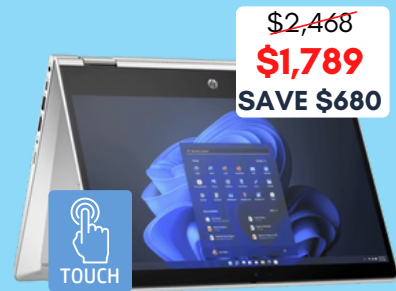
HP ProBook 435 x360 G10 13.3" AMD Ryzen 7 + 3yr Onsite Support 16GB RAM / 512 GB Storage Touchscreen + Pen