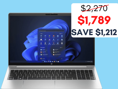
HP ProBook 440 G11 14" Intel i7 + 3yr Onsite Support 16GB RAM / 512GB Storage