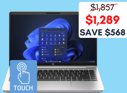
HP ProBook 440 G11 14" Intel i5 + 3yr Onsite Support 16GB RAM / 256GB Storage Touchscreen