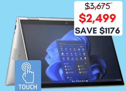
HP EliteBook 830 x360 G11 13.3" Intel i7 + 3yr Onsite Support 16GB RAM / 512GB Storage Touchscreen + Pen