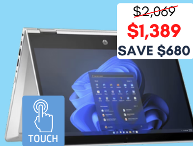
HP ProBook 435 x360 G10 13.3" AMD Ryzen 5 + 3yr Onsite Support 16GB RAM / 256 GB Storage Touchscreen + Pen