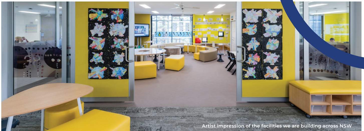
Artist impression of the facilities we are building across NSW